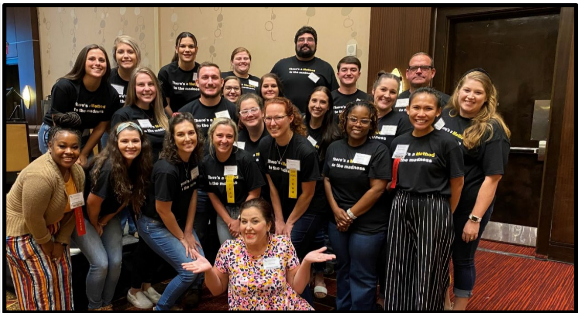
Pictured above is the students and faculty from Baton Rouge General